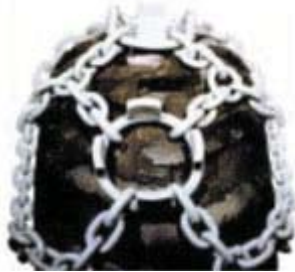
Regular Floating Ring