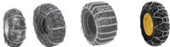
ATV.....Forklift.....Snow Blower....Skid Steer