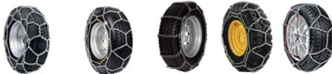
Supergreisteg...Classic V... MAMMUT ...Sprint...Grip 4x4