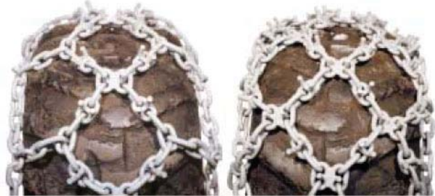
Diamond Studded - Single