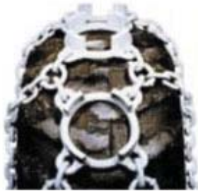
Tight Fixed Ring