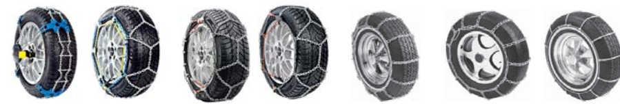
Centrax...Classic...easy2go...Grip...Square Link...Twist Link...Cable