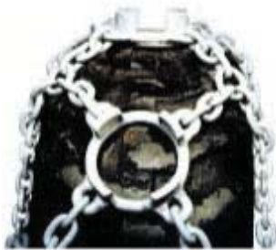
Regular Fixed Ring